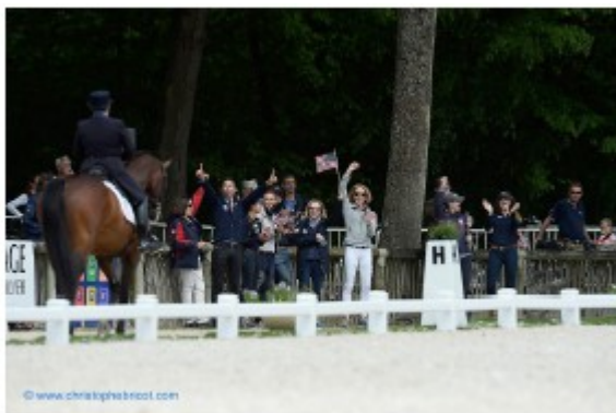
The USA Team CDI O 5*-FEI Nations Cup

Each test brings in points for the final ranking of the nations.