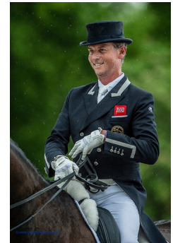
Carl HESTER (GBR) – CDI 3*